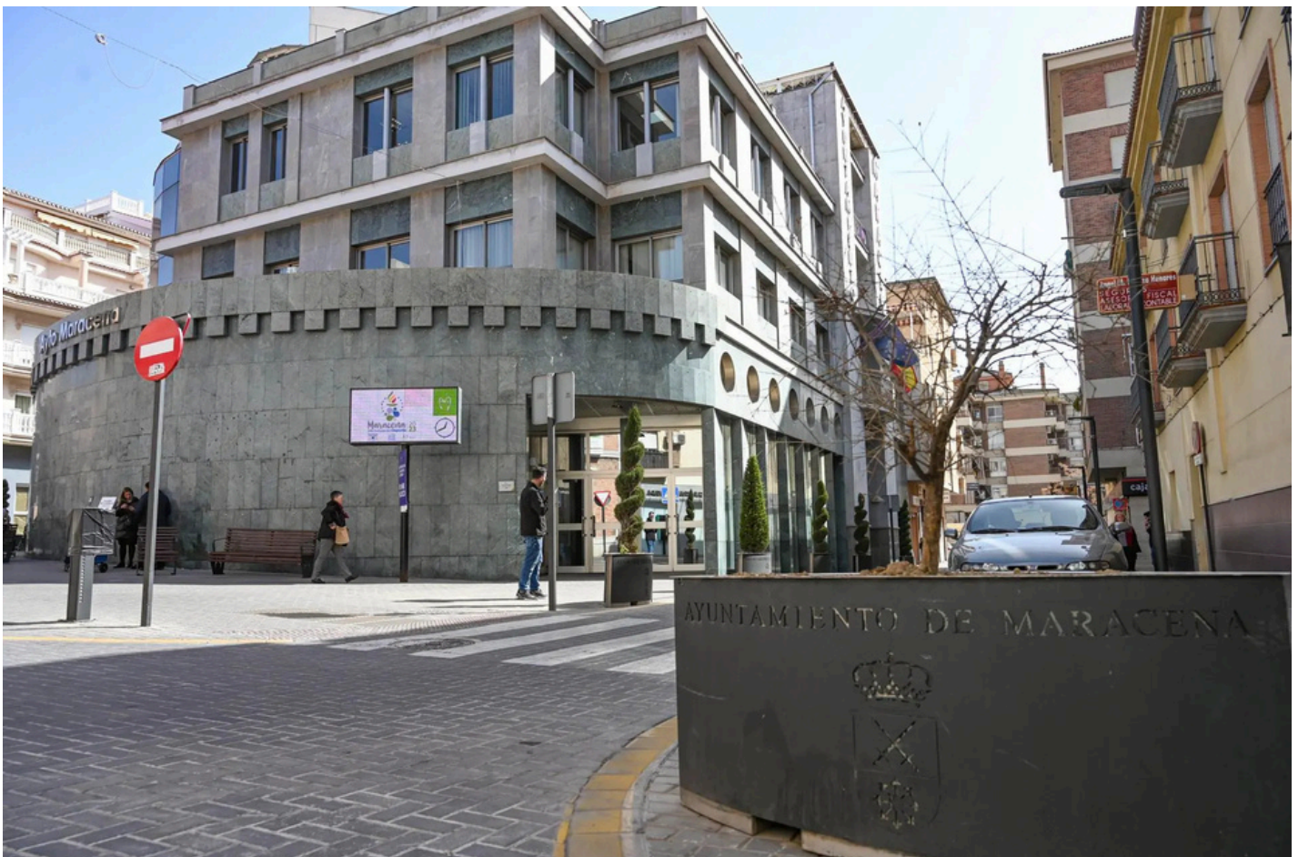
Image of Maracena's city hall. site: https://efe.com/andalucia/2024-04-02/cronologia-de-un-secuestro-que-marco-la-politica-de-maracena-granada

The youth center of Maracena is one of the most active and remarkable in the Andalusia region. Espacio Joven runs an eco project named ECO CASA which motivates young local people to be more ecofriendly and to promote suitable values.